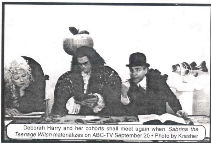
Deborah Harry and her cohorts shall meet again when Sabrina the Teenage Witch materializes on ABC-TV September 20